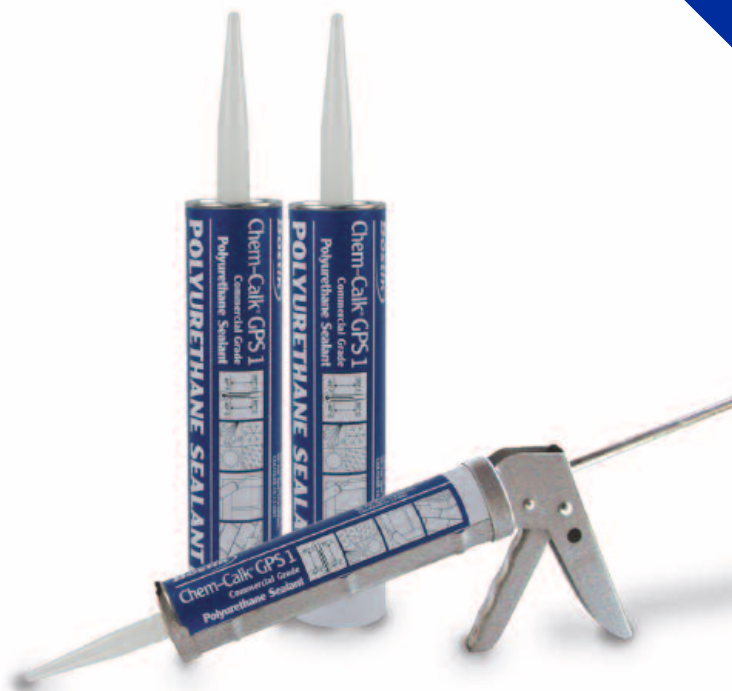
TABLE 1: CHEM-CALK® GPS1 TYPICAL UNCURED PROPERTIES*